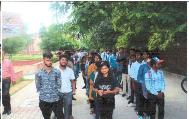
Figure 2 Marathon, 19/3/2019