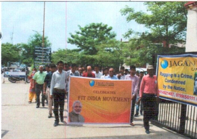
Figure 1 Marathon, 19/3/2019